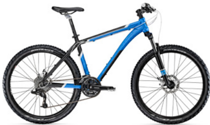
2011 Trek Wahoo