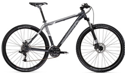
2011 Trek Marlin