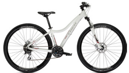
2013 Trek Cali