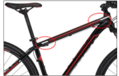
Figure 2. Location of the model name.

The model name is written on the frame, usually at one end of the top tube (figure 2).