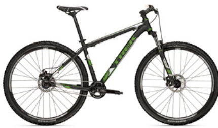
2012 Trek Marlin SS