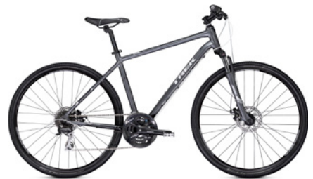
2013 Trek 8.3 DS