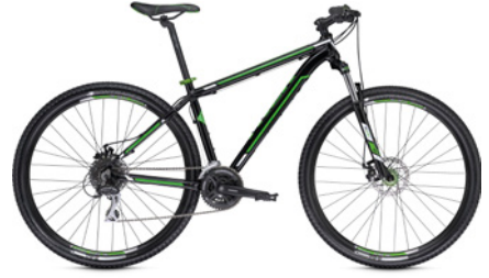
2013 Trek Wahoo