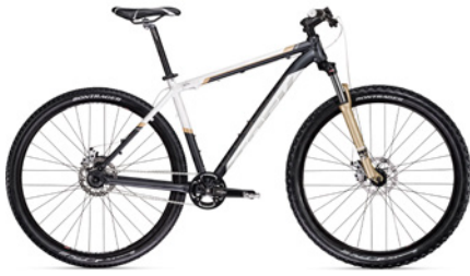
2011 Trek Marlin SS