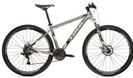
2012 Trek Marlin