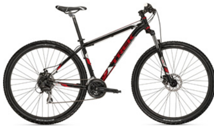
2012 Trek Wahoo