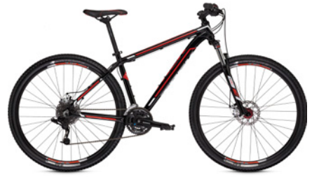
2013 Trek Marlin