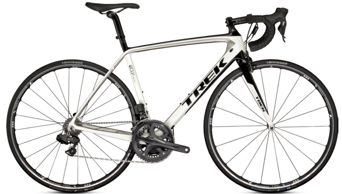
2013 Madone 6.5