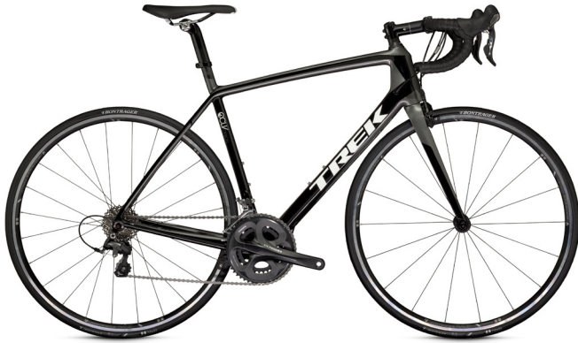
2013 Madone 5.2 & Madone 5.2 WSD