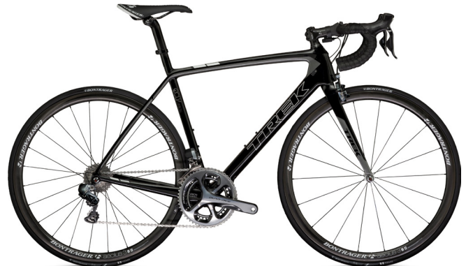
2013 Madone 7.9 & Madone 7.9 WSD