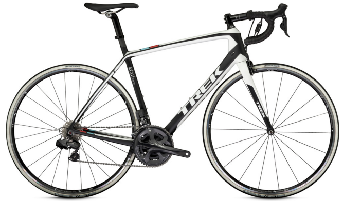
2013 Madone 5.9