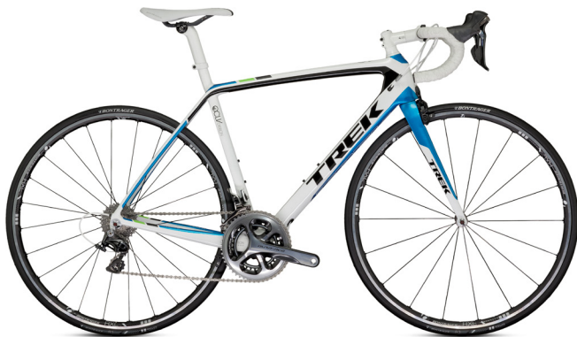
2013 Madone 7.7