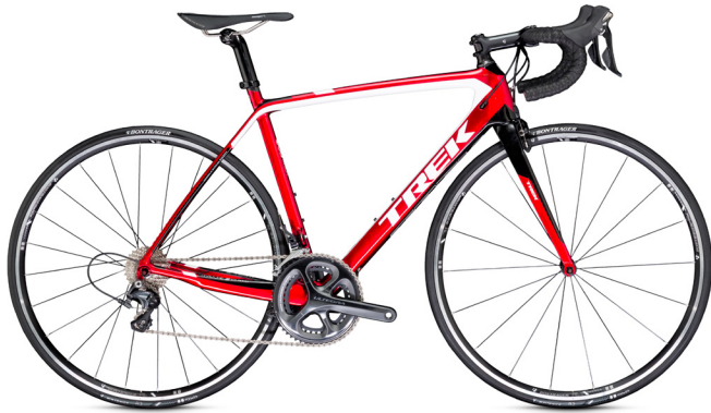
2013 Madone 6.2 & Madone 6.2 WSD