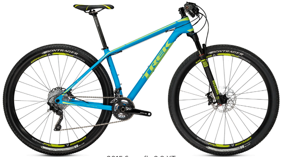
2015 Superfly 9.8 XT